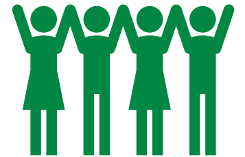
Staff and Volunteers

Each has goals and strategies to help achieve the priority. In total, there are eighteen (18) goals and sixty-four (64) strategies.