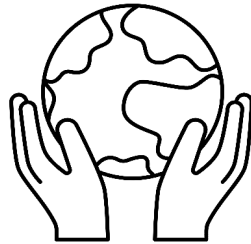
Public Health and Safety