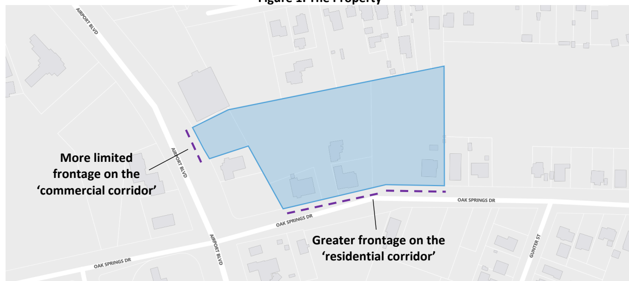
Figure 1. The Property

The Owners have also requested a waiver of the ground-floor commercial requirement, in order to have the option to construct a fully residential building. We believe this request is appropriate given the Property layout, as shown in Figure 1 and discussed in more detail below.