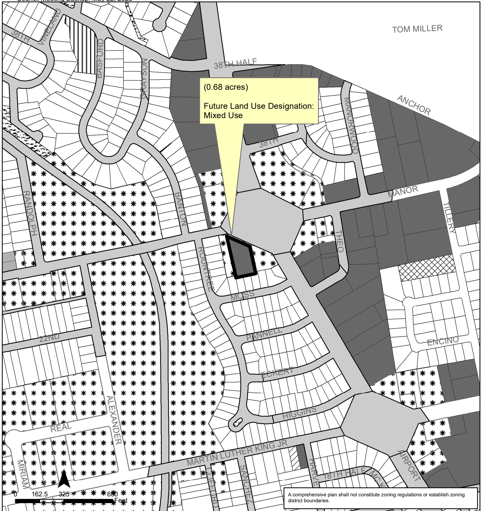
Exhibit A Rosewood Neighborhood Planning Area NPA-2024-0008.02

This product is for informational purposes and may not have been prepared for or be suitable for legal, engineering, or surveying purposes. It does not represent an on-the-ground survey and represents only the approximate relative location of property boundaries.