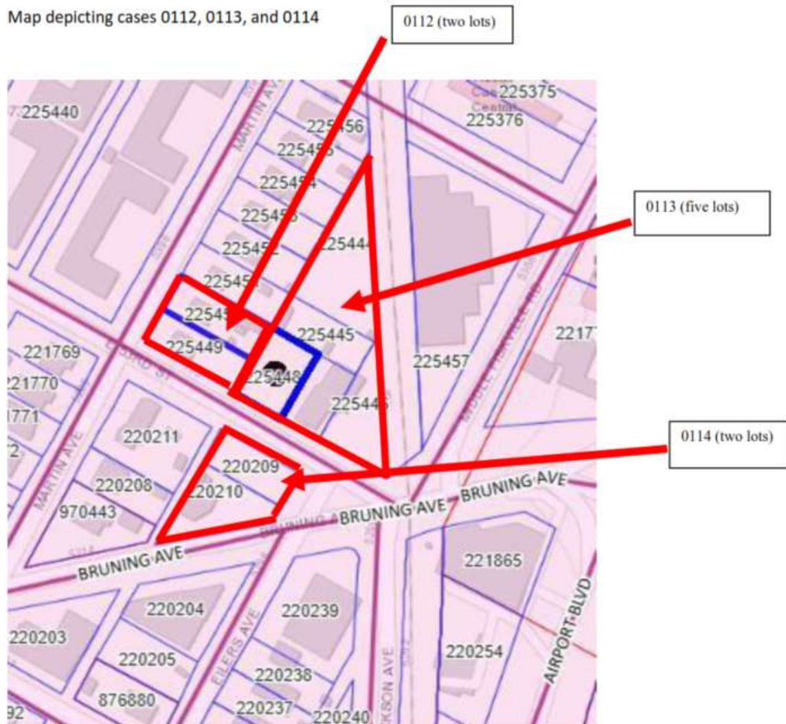
Map depicting cases 0112, 0113, and 0114