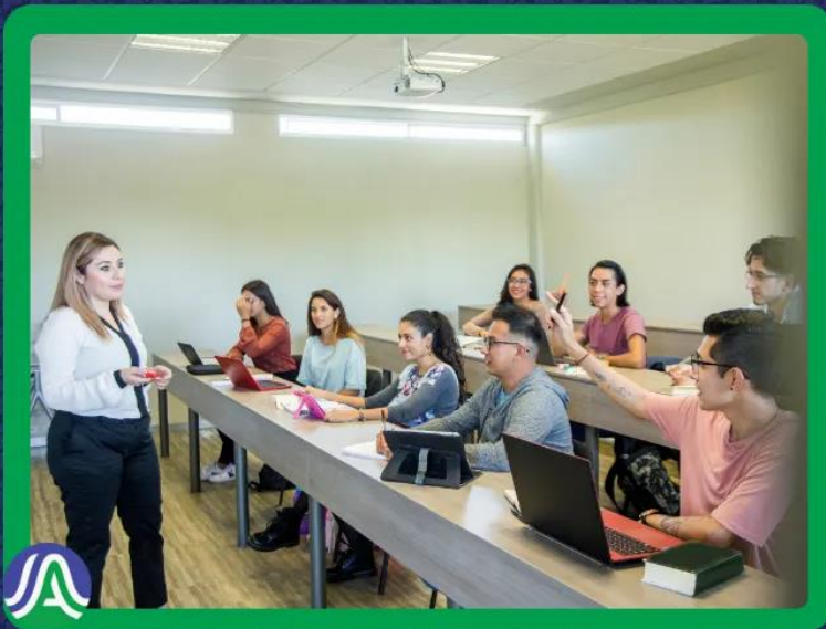
Austin Small Business Week