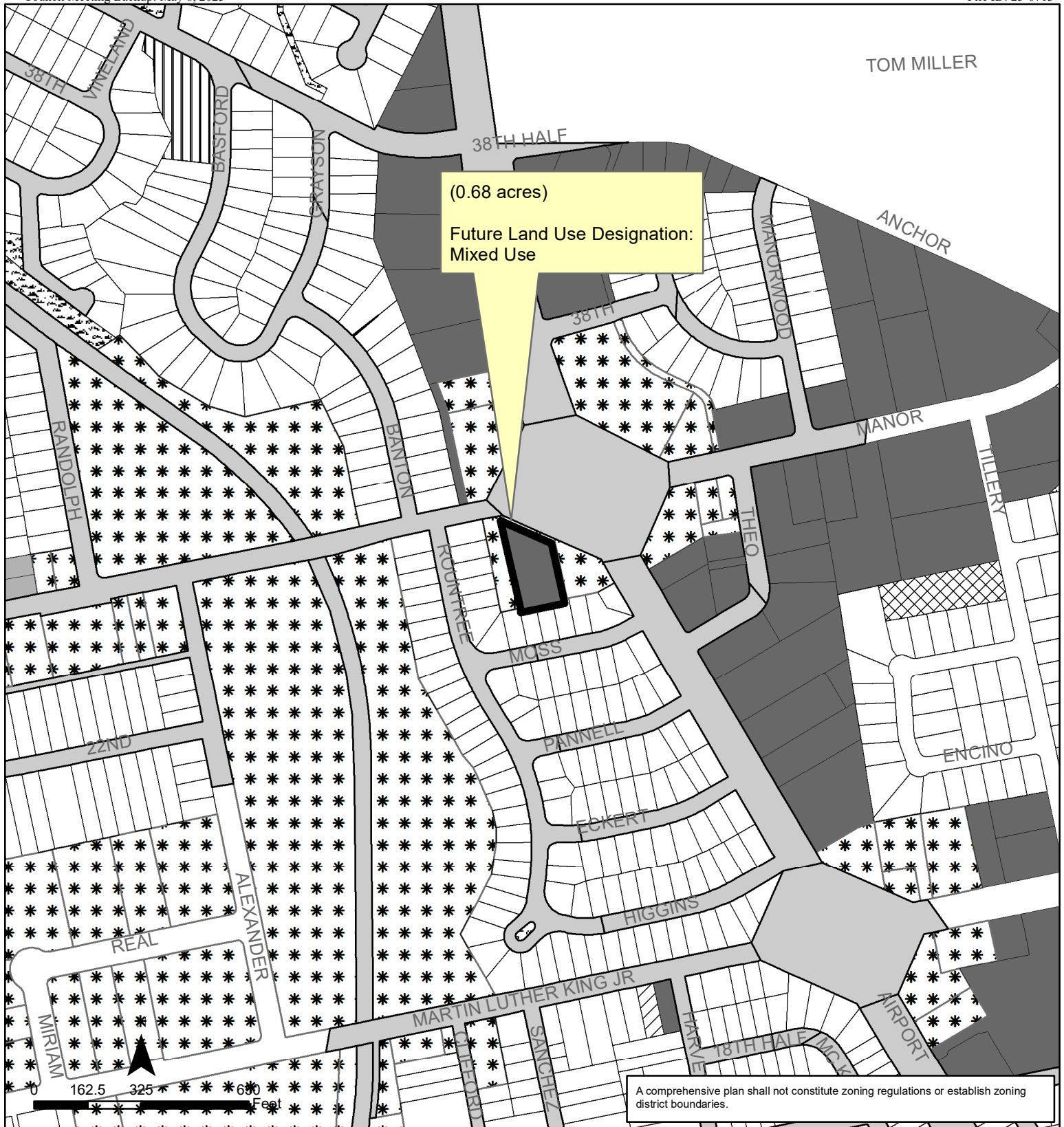
Exhibit A Rosewood Neighborhood Planning Area NPA-2024-0008.02

This product is for informational purposes and may not have been prepared for or be suitable for legal, engineering, or surveying purposes. It does not represent an on-the-ground survey and represents only the approximate relative location of property boundaries.