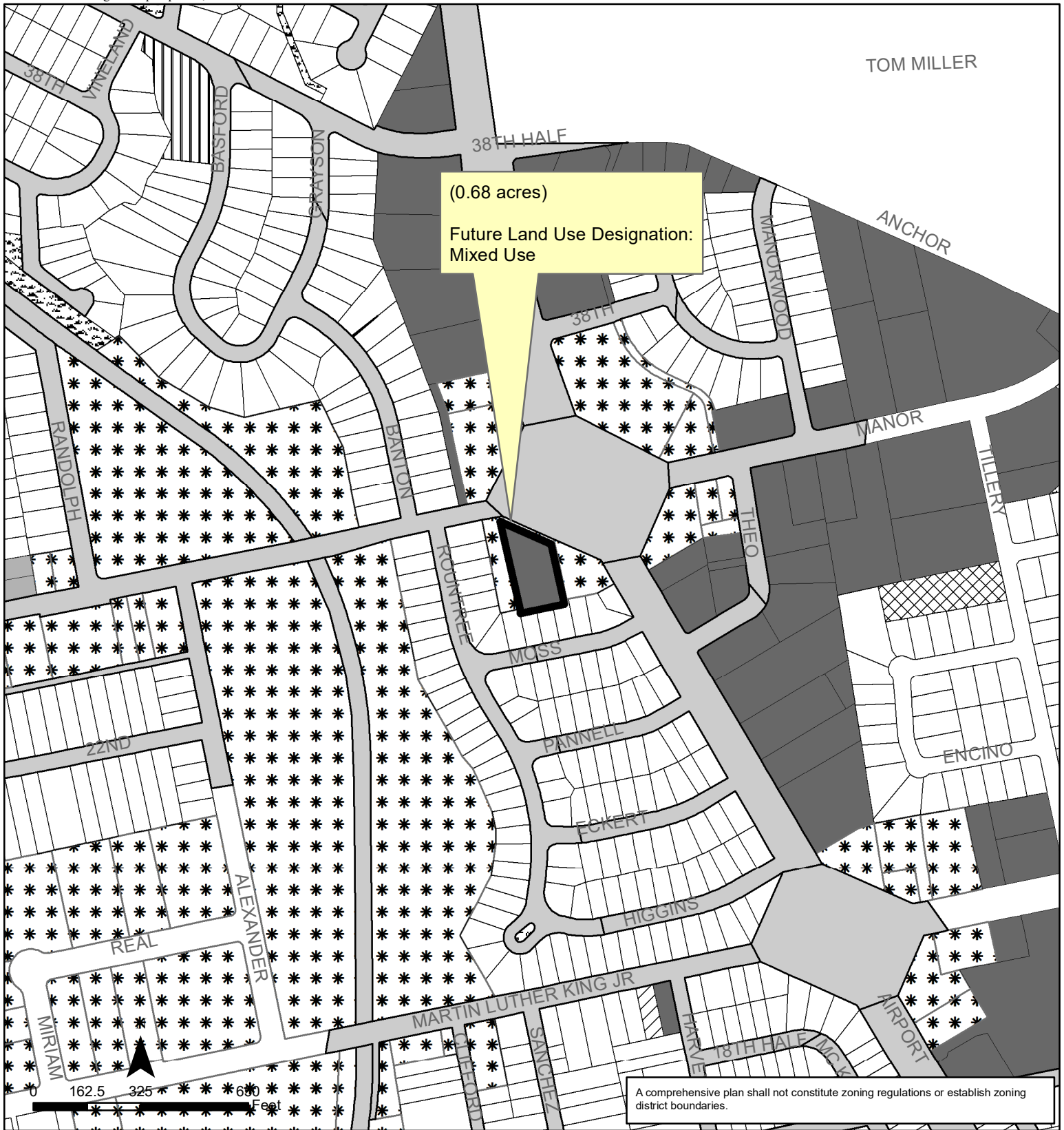
Exhibit A Rosewood Neighborhood Planning Area NPA-2024-0008.02

This product is for informational purposes and may not have been prepared for or be suitable for legal, engineering, or surveying purposes. It does not represent an on-the-ground survey and represents only the approximate relative location of property boundaries.