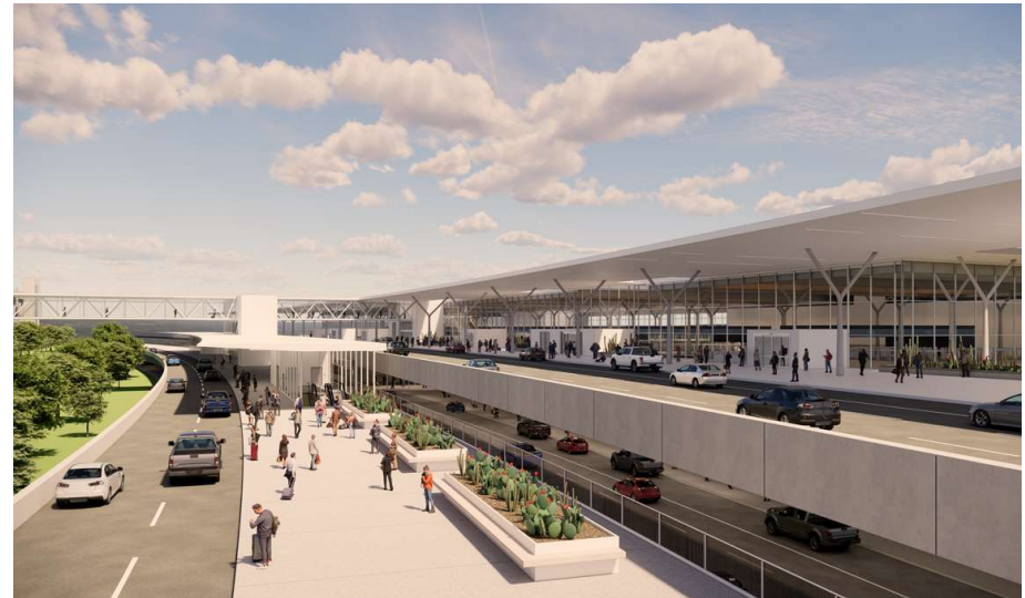
Pre-design conceptual rendering. Final design specifications and features subject to change as the project progresses.