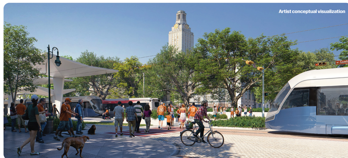
The Drag The station at UT on a typical game day with a redesigned and pedestrian-centric Guadalupe Street.