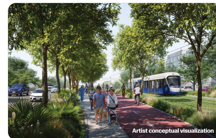
East Riverside A new shaded walk and bike path along the line on East Riverside, designed to improve walkability.