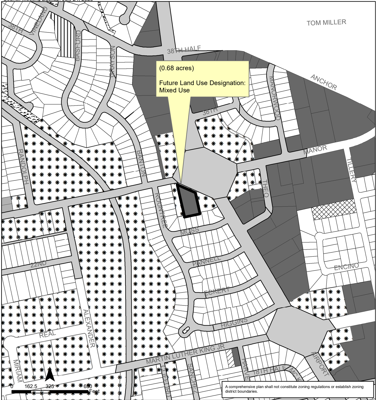
Exhibit A Rosewood Neighborhood Planning Area NPA-2024-0008.02

This product is for informational purposes and may not have been prepared for or be suitable for legal, engineering, or surveying purposes. It does not represent an on-the-ground survey and represents only the approximate relative location of property boundaries.