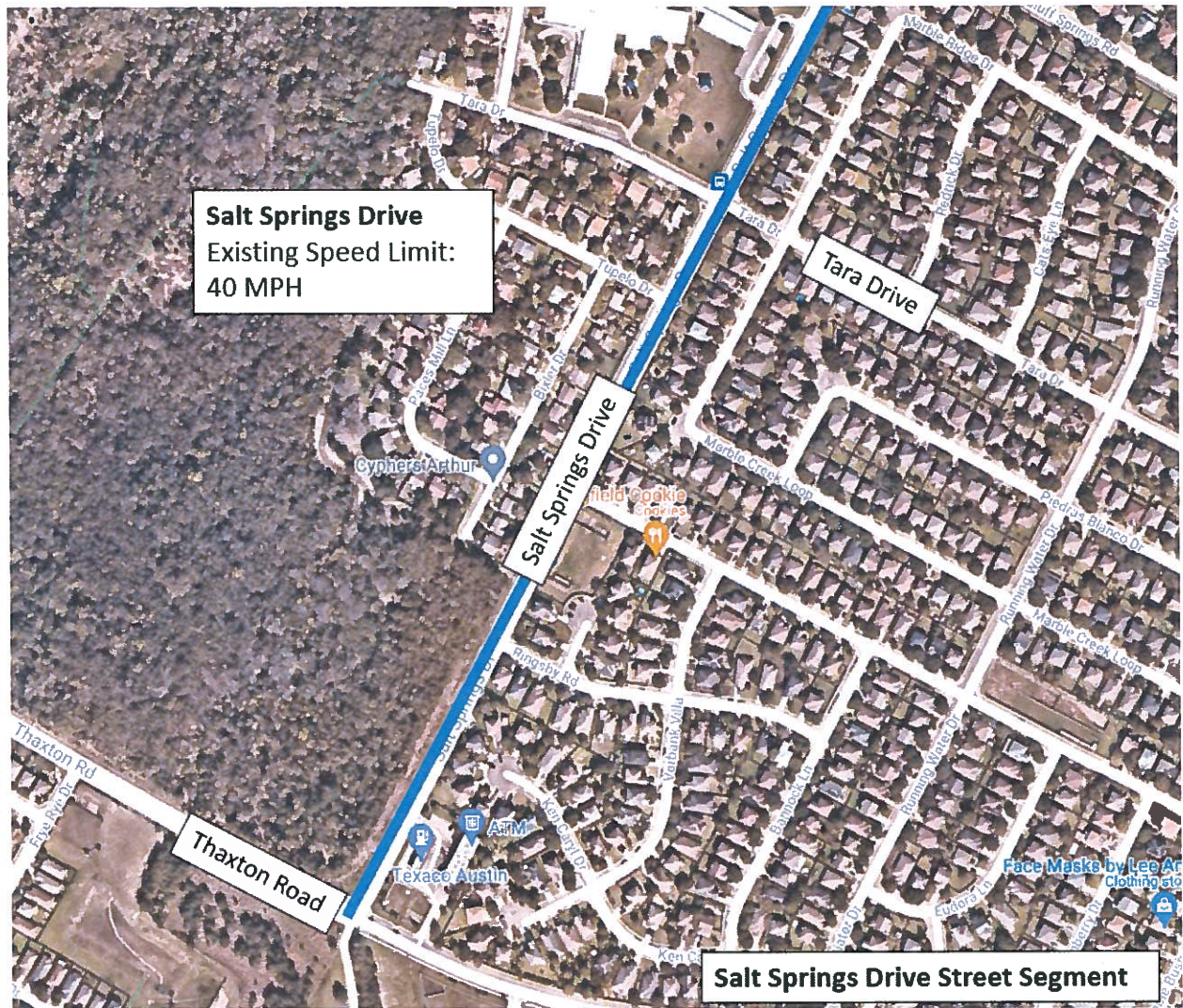
Figure 3: Street Segment Tara Drive to Thaxton Road