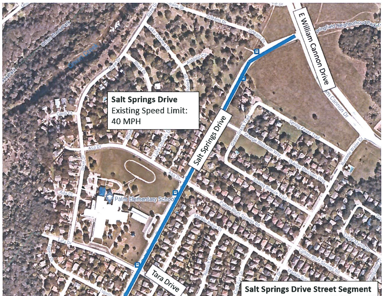
Figure 2: Salt Springs Drive from E William Cannon Drive to Tara Drive