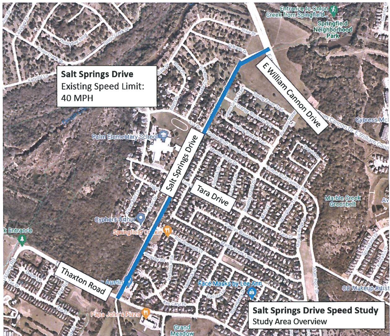
Figure 1: Study Area Aerial