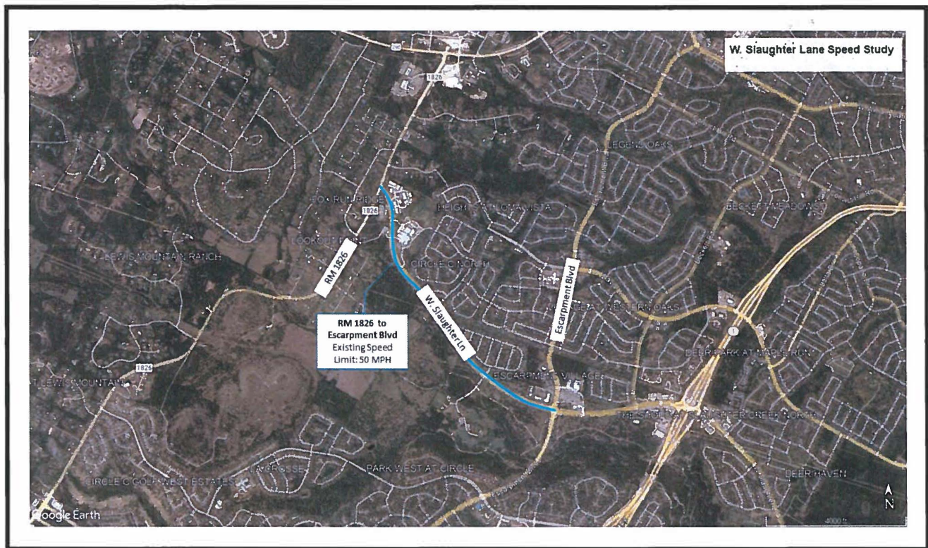
Figure 1: Study Area Aerial View